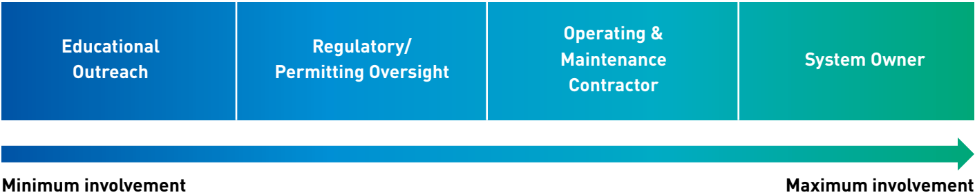
Figure 1 A spectrum of utility involvement in ONWS

Utilities have a wealth of knowledge in how to effectively operate water and wastewater systems, from operations to monitoring, maintenance, and much more. As customers and others in their service territory are exploring onsite reuse projects, utilities can be one of the best resources for planning and implementing them. Beyond providing outreach and education to developers, commercial customers, and property owners, utilities can champion ONWS by building public and political support through education of the general public and government officials.