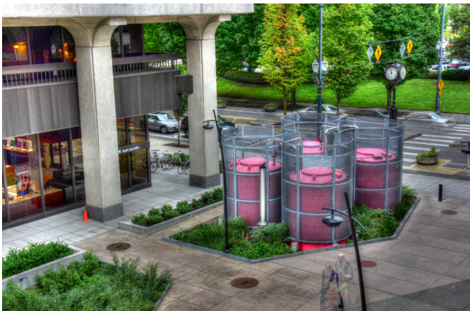
Natural Organic Recycling Machine (NORM) at Hassalo on Eighth, Portland, OR.