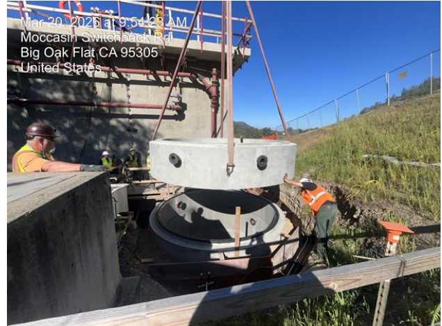
Moccasin Wastewater Treatment Plant: Influent Pump Station Riser Installation