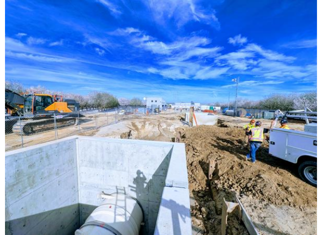
San Joaquin Pipeline Valve and Safe Entry Newly Backfilled Removable Spool Piece Vault at Pelican Valve House, Prior to Lids being Installed