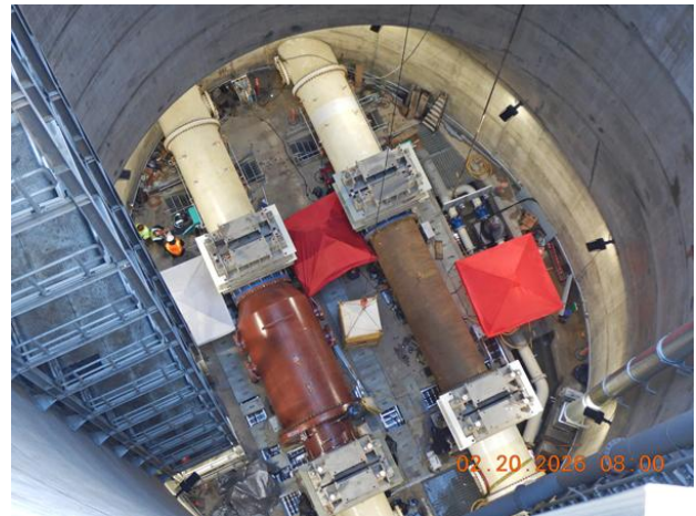
Mountain Tunnel Improvements Project: Priest Flow Control Facility Shaft with two 72-inch diameter pipes, four Knife Gate Valves, one Sleeve Valve and one Spool Piece