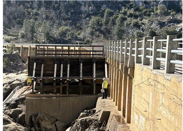
Eleanor Dam Bridge Interim Repair Sub-Project: Pre-Construction Survey