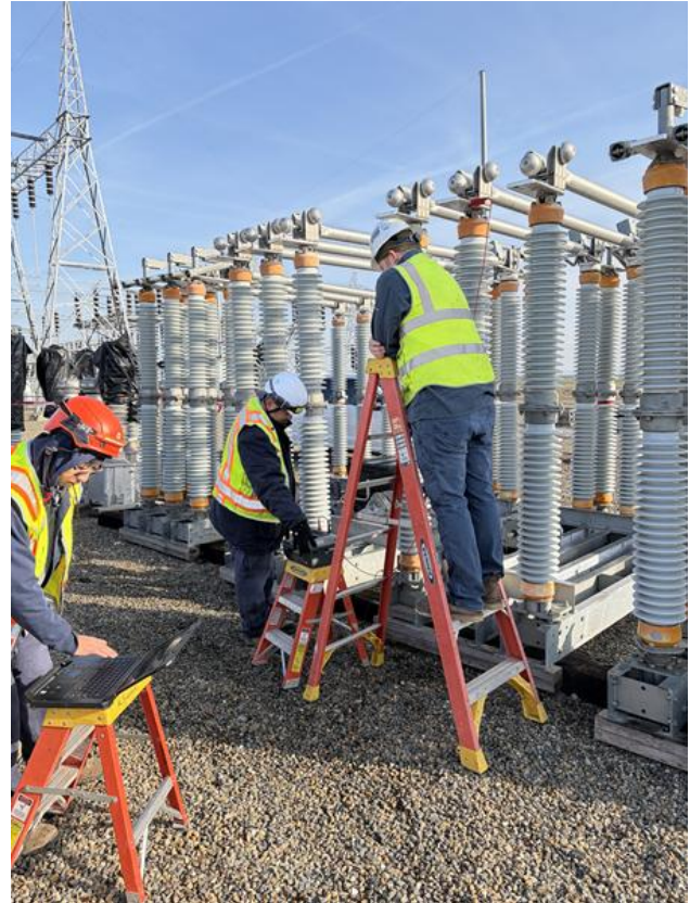
Warnerville Substation: Pretesting City Furnished High Voltage Switches