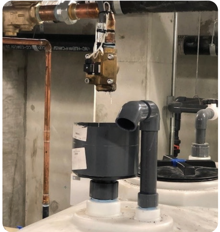
Potable make-up water is supplied to the treated water storage tank via an air gap.