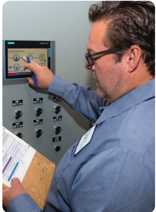
The Treatment System Manager can train building staff to perform routine inspections and maintenance.