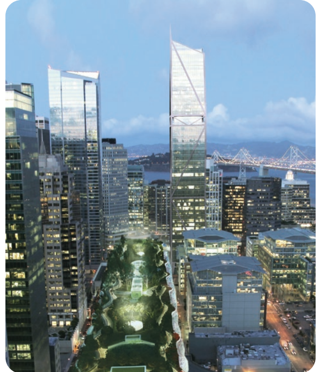
181 Fremont is a mixed-use residential building capturing graywater and rainwater, treating, and reusing it for toilet flushing and irrigation.