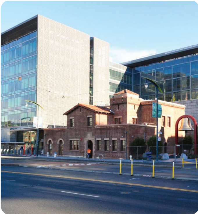
San Francisco's Public Safety Building operates a rainwater system that treats rainwater collected from the roof for sub surface irrigation and cooling tower makeup