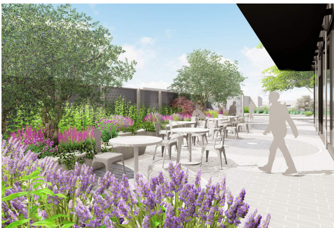
Rendering New Operations, Engineering, and Maintenance Buildings