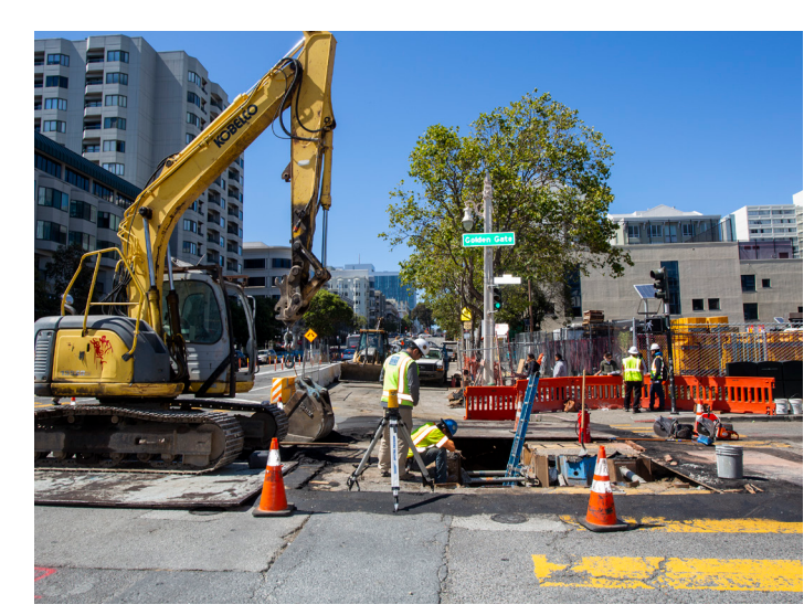
Van Ness Improvement Project: construction activity

The SFPUC partners with SFMTA and SFPW to "dig once" where feasible to reduce impacts to the community and deliver projects more efficiently. These interdepartmental projects include the Van Ness Improvement Project, Geary Rapid Transit Program, L Taraval Improvement Project and the Better Market Street Improvement Projects to upgrade aging sewer infrastructure while the City performs above ground surface and transit improvements. The partnership ensures maximization of City resources and minimization of disruption to the communities we serve.