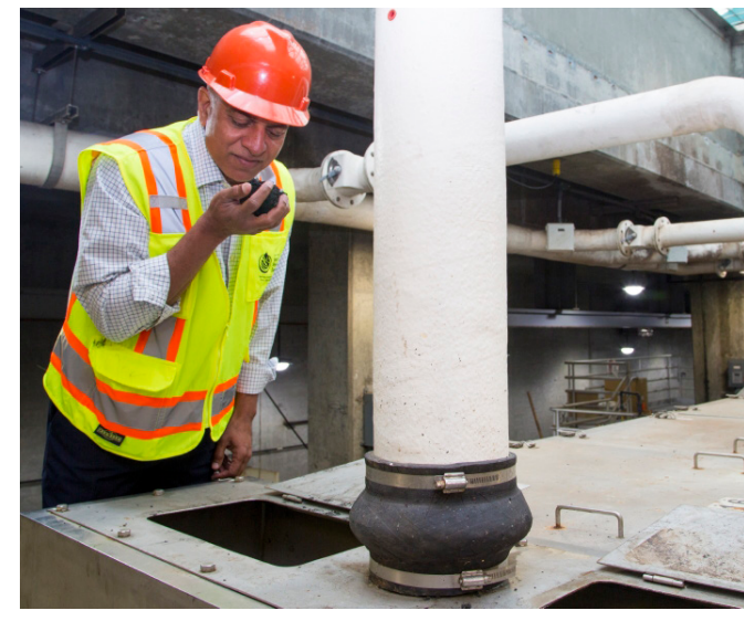
Successfully converted our biosolids into a marketable, renewable fertilizer, which is now being sold to local farms

4 Sewer System Improvement Program FY19-20 Annual Report 5