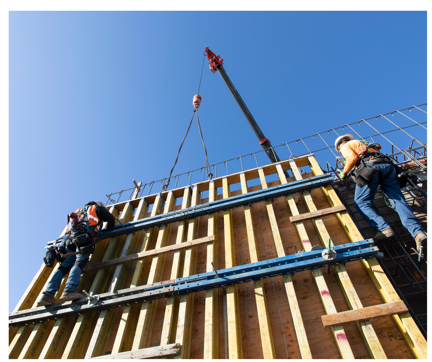
Mariposa Pump Station Improvements Project: Installing wall formwork on pump station.

The SSIP supplements our Renewal and Replacement Program by making significant capital investments to upgrade and modernize our aging system to ensure a resilient, reliable, and sustainable system now and for generations to come.