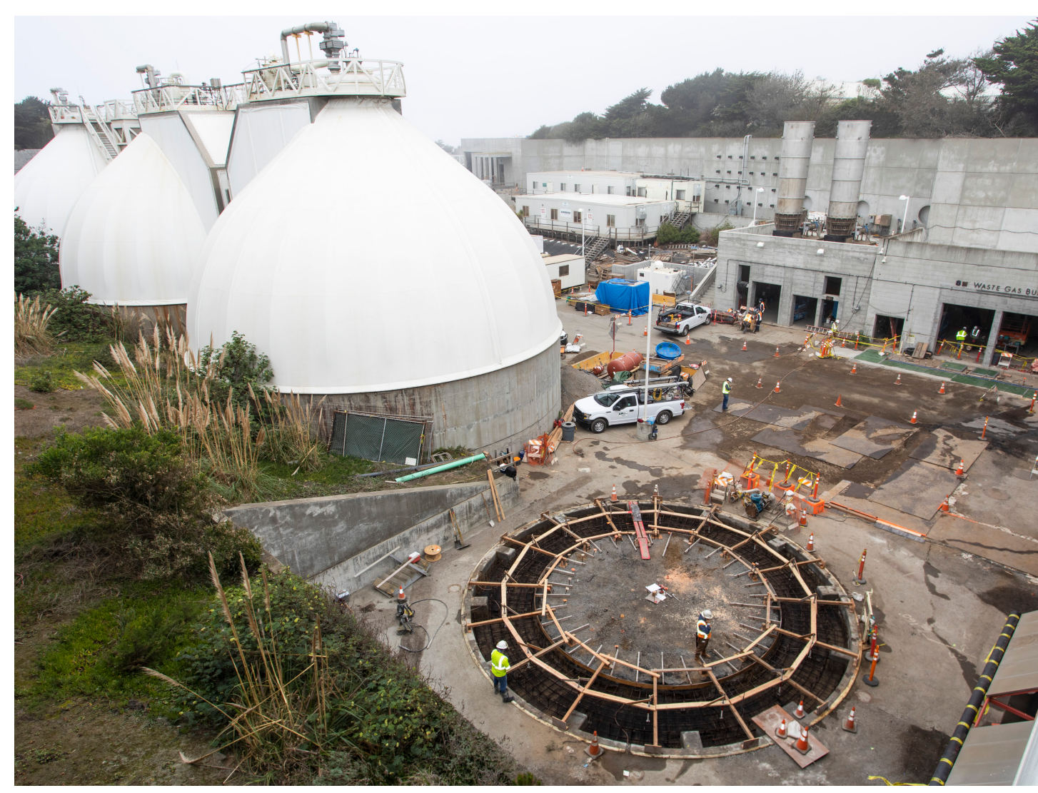
Digester Gas Utilization Upgrade Project - Concrete pour on future location of gas holder tank that will hold excess digester gas.

The Westside Pump Station Reliability Improvements Project design team optimized the scope of the project to align with the available capital project budget and established a pre-qualified contractor pool for the construction contract bid opportunity. The project will bring efficiency and redundancy to this critical component of the westside system. Construction is expected to get started in summer 2021.