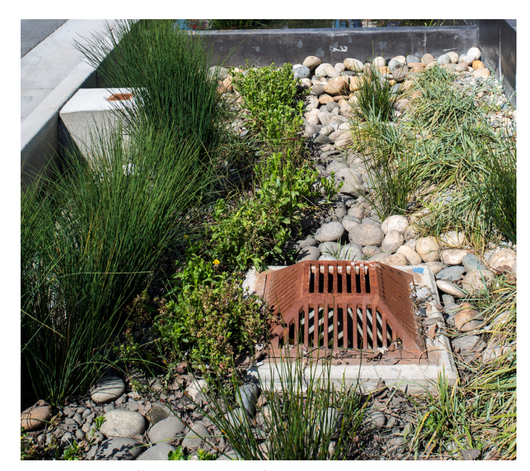
Visitacion Valley Green Nodes

The table to the right represents the status, drainage management area, performance, and green infrastructure technology features of all eight early implementation projects, each constructed in one of San Francisco's eight watersheds.