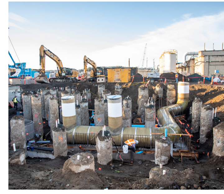
Southeast Wastewater Treatment Plant, Headworks Facility Project: Installation of subsurface pipework around foundation piers

During this period, we finalized a new US EPA Water Infrastructure Finance and Innovation Act (WIFIA) loan of $525 million for the Southeast Treatment Plant Improvements Project and refinanced the Biosolids Digester Facilities Project $699 million WIFIA loan agreement to reduce interest rate from 3.09% to 1.84%. Combined, these efforts will save millions in interest payments for our ratepayers.