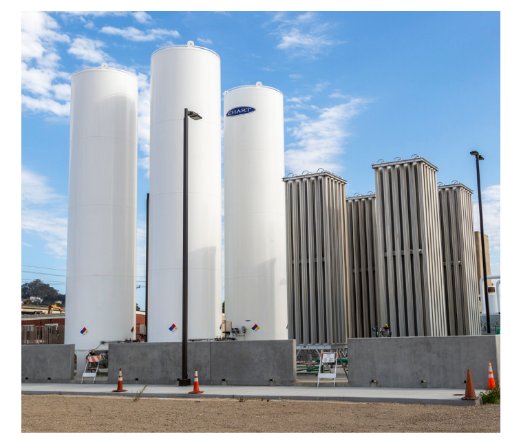
SEP Cryogenic Oxygen Generation Plant Demolition & Liquid Oxvaen Uparades

The scope, schedules, and budgets of SSIP's baseline were revised in April 2018. SSIP management will undertake this exercise approximately every two years coincidental with our budget cycle to refine scope needs and establish more accurate schedule and budget forecasts. We are making significant progress across the active SSIP projects, including the first phase of 70 projects launched at the start of the Program and additional projects initiated in 2018. We have developed a longterm adaptive planning process to regularly evaluate and prioritize future projects as part of the rolling two-year budget and 10-year capital planning cycles. Below are metrics that demonstrate progress across the Program. More detailed information can be found in our Quarterly Reports.