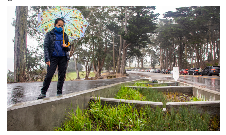
Baker Beach Green Streets: Rain gardens during wet weather on El Camino Del Mar

The Sunset Boulevard Greenway project's Phase 2 of construction began in November 2019 implementing construction of rain gardens and bioretention basins along several blocks of Sunset Boulevard spanning Lincoln Avenue to Wawona Street. Construction of the Learning Lab adjacent to St. Ignatius College Preparatory will offer students in the neighborhood a place to gather to study stormwater management via green infrastructure.