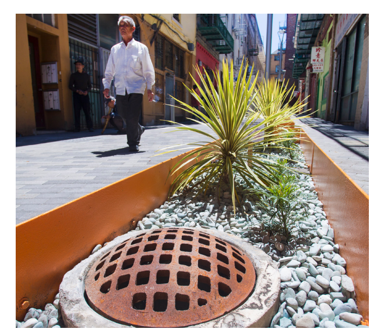
Chinatown Green Alley