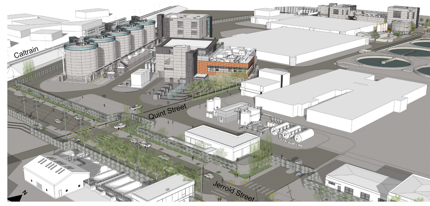
Rendering of new southeast treatment facilities and relocation of biosolids digesters