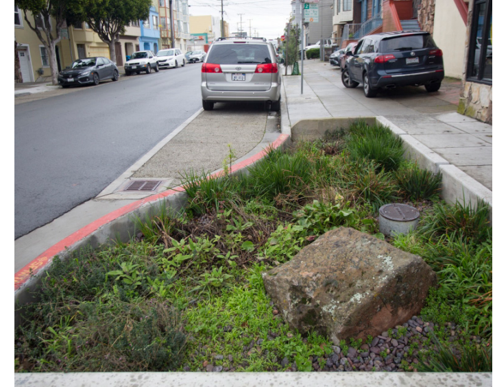
Holloway Green Street