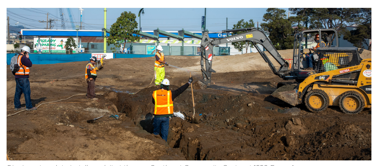
Digging a trench to install conduit at the new Southeast Community Center at 1550 Evans Avenue

This 2019-2020 annual report provides a review of our efforts and recent accomplishments, and a look ahead to the year to come as we continue to invest in our critical facilities, the people who build and run them, and the communities in which they're located.