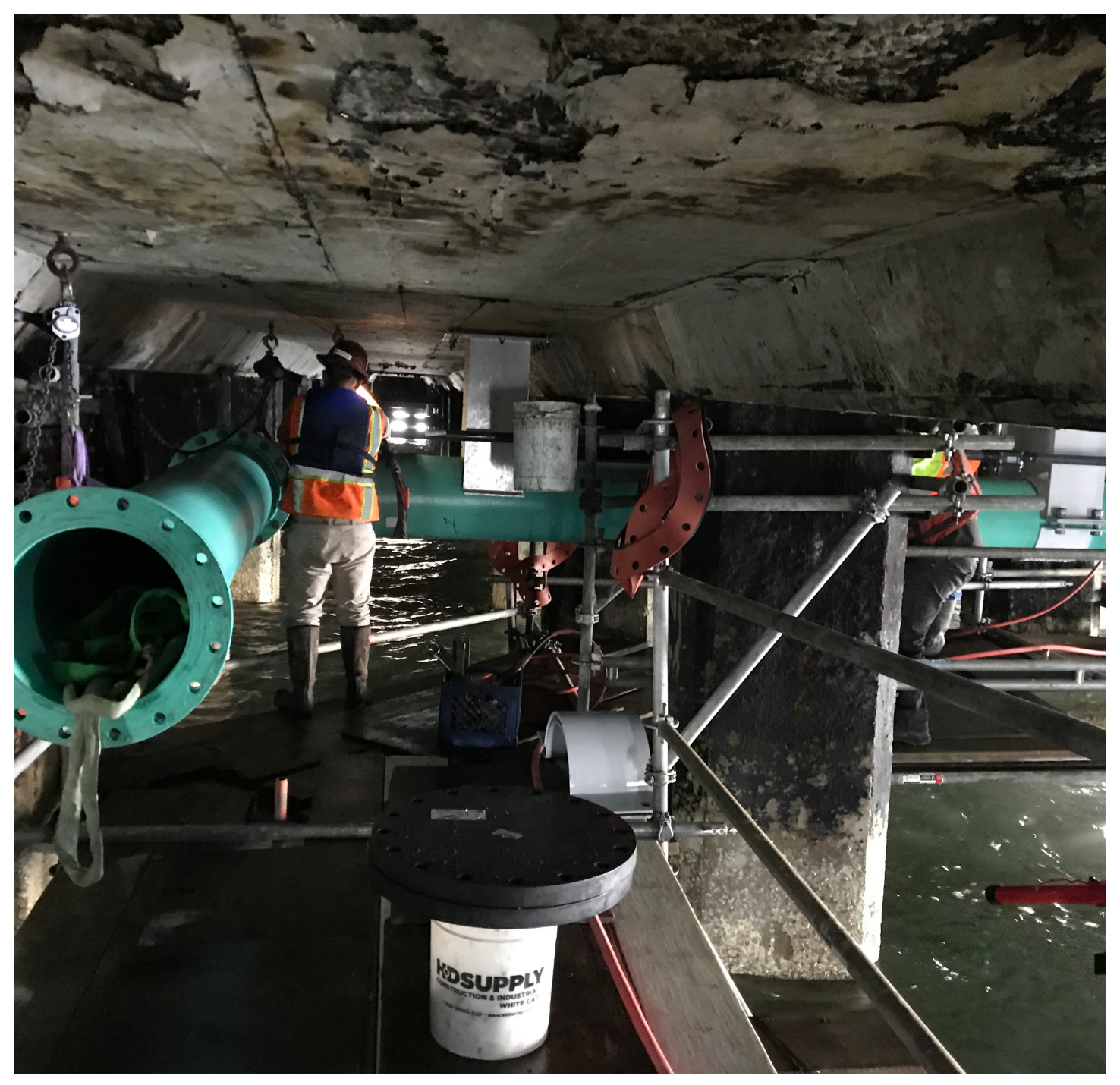
North Point Facility Outfall Rehabilitation Project: installation of outfall structure beneath pier 35

Planning for the North Shore Wet Weather Pump Station Project continued through this period and construction is anticipated to begin in 2021. The project will replace four dry weather pumps with larger units providing redundancy during wet weather, upgrade electrical distributed control systems (DCS), address corrosion and ensure this facility continues to protect our community and the health of the Bay.