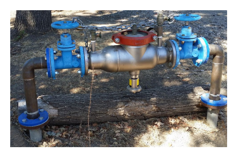
Example of a Backflow Prevention Assembly

You are responsible for arranging for annual testing of your backflow prevention assemblies by a tester approved to work in San Francisco. The tester must have a valid Permit to Operate issued by the San Francisco Department of Public Health. A list of companies employing Authorized Backflow Prevention Assembly Testers is available at <a href="https://www.sfdph.org/backflow">www.sfdph.org/backflow</a>.